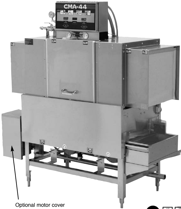
Optional motor cover